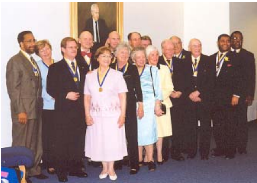
Past and present DAG members gather after the festivities.