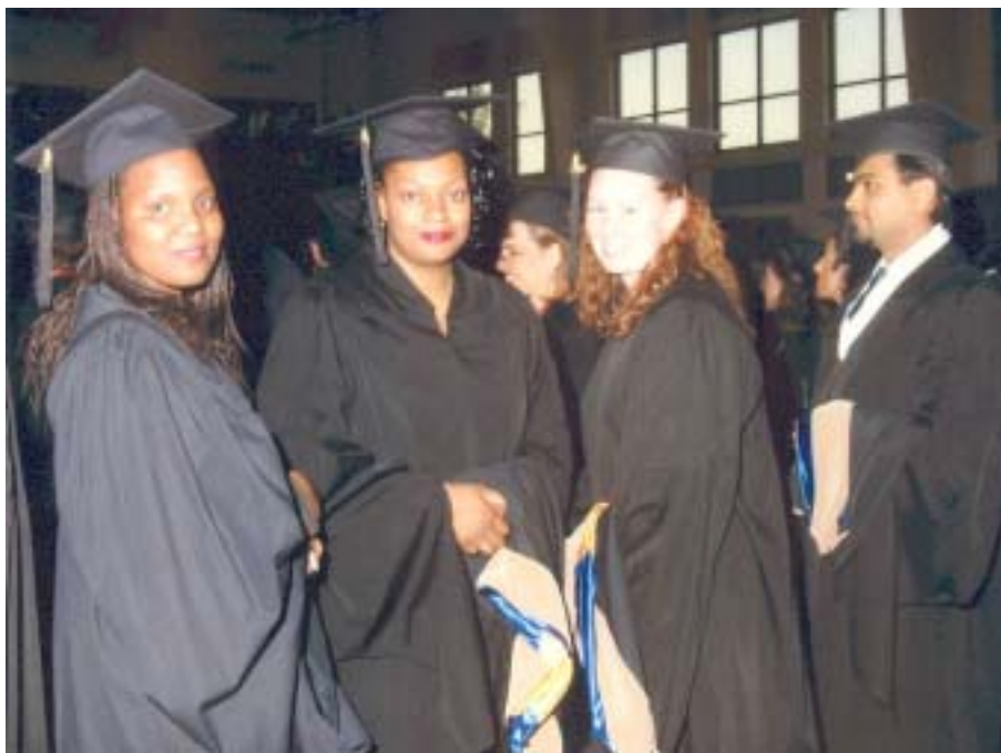
Eighty-eight students graduated from the MBA program in 2002 earning degrees with concentrations in Finance Management, Human Resource Management, Information Technology, Marketing/Management, and Comprehensive.