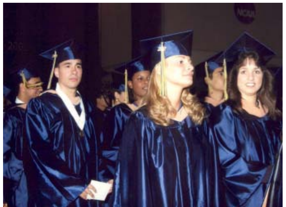
The Class of 2002 are ready to celebrate their accomplishments.