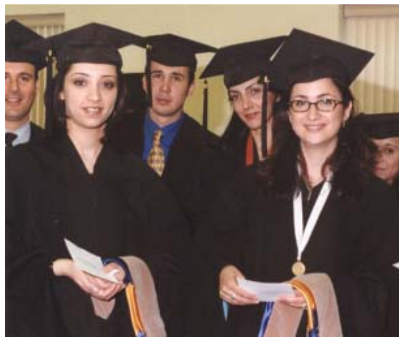
These MBA students prepare for graduation ceremonies.