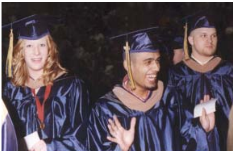
Congratulations to the graduates of GBC's 116th commencement. Keep your ties to the College by becoming active members of the Alumni Association.