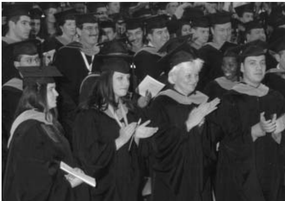
MBA graduates have contributed a wealth of experience to the education program at GBC.