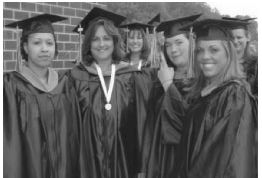
GBC faculty and staff are confident that the Class of 2005 has the knowledge and skills needed to be successful in their business endeavors.