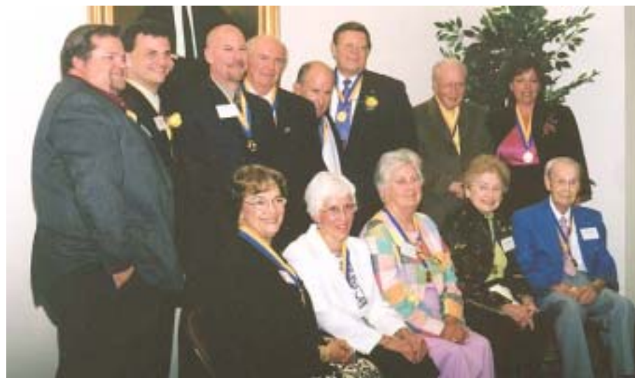
Past and present DAG members gather after the ceremonies.