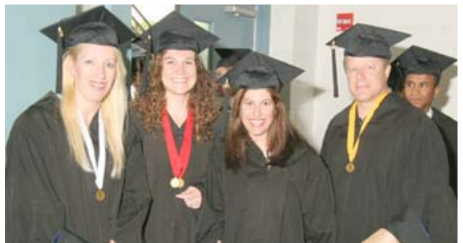
MBA graduates show pride in reaching their goal.