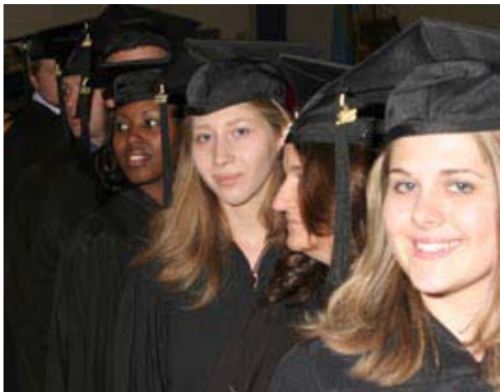
Over 140 graduates received their MBA degree from the College this year. The MBA program offers four concentrations - Finance Management, Human Resource Management, Information Technology and Marketing Management, as well as a comprehensive MBA.

GBC welcomes you as alumni and hopes you will keep your ties to the College by being active participants in the Alumni Association.