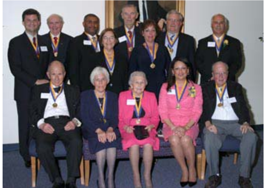
Past and present Distinguished Alumni Gallery members