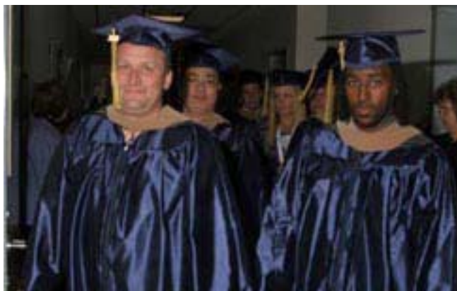
The joy of achieving their educational goals is evident on the smiling faces of these Bachelor of Science degree graduates. GBC staff and faculty remind all graduates that lifelong learning will be essential to meet the challenges of the future and are grateful that they have played a part in your preparation for the working world.