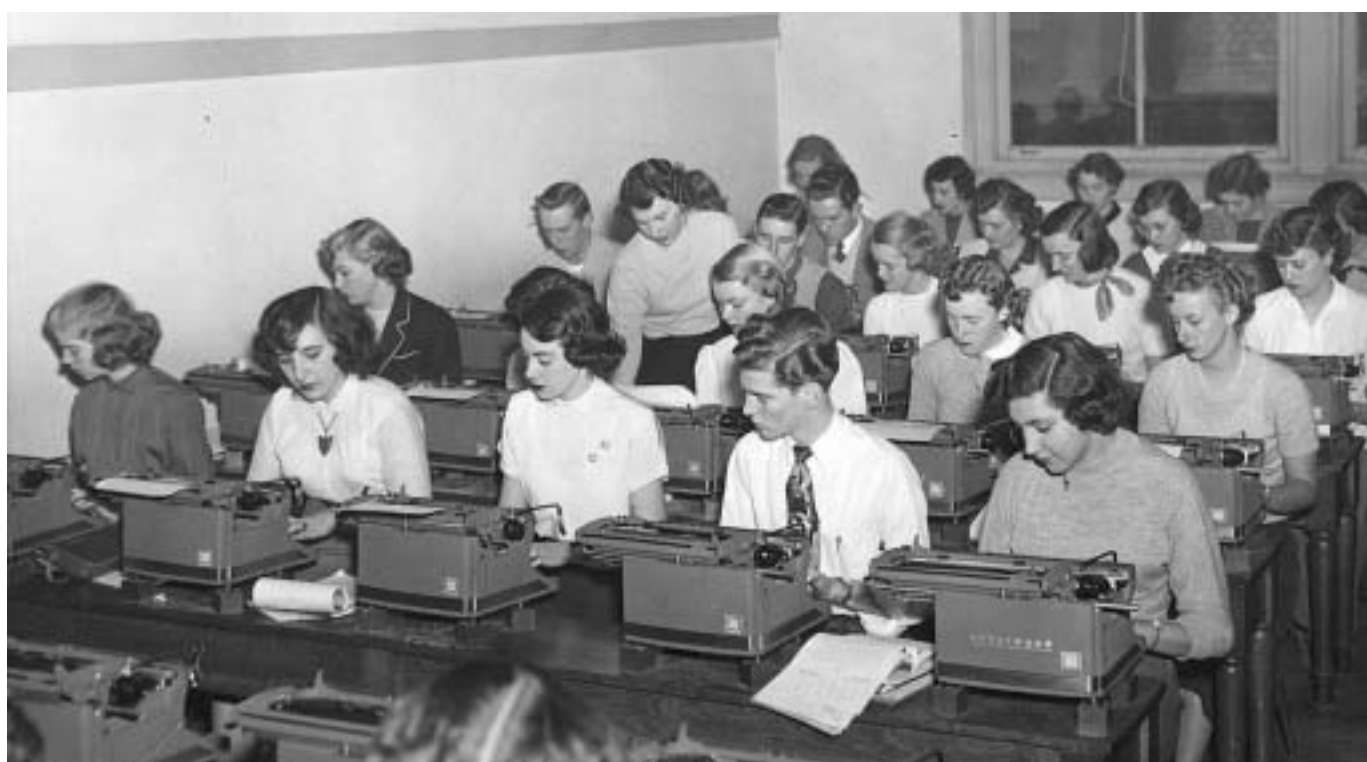
Before PCs: Co-ed typing class prepares for a timed typing test.

Do you recognize any of these GBC students from the past?