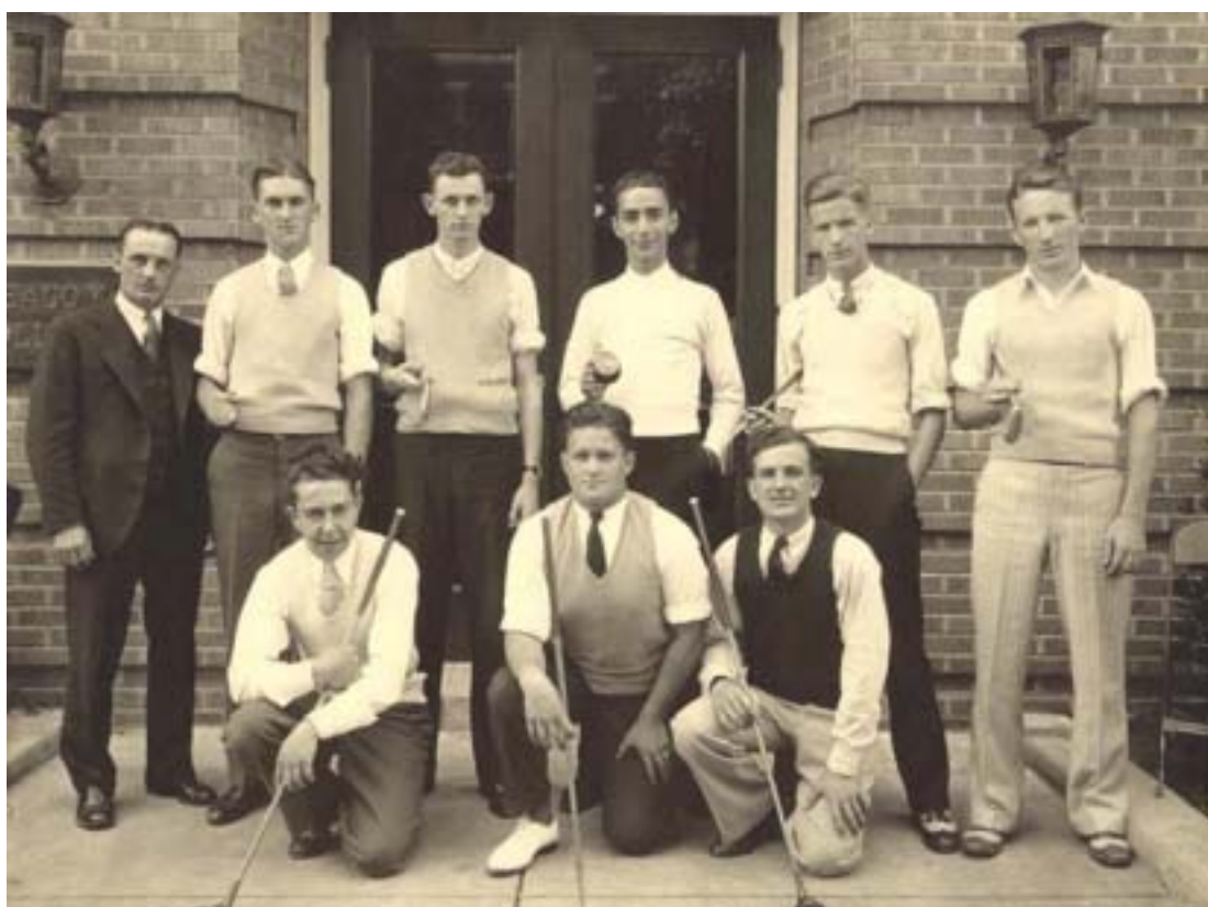
Men's golf team—these men were the real "swingers" at GBC.