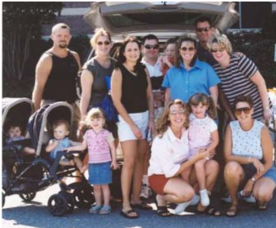
These alumni had a great time renewing their ties to GBC. Homecoming is the perfect opportunity for old friends to get together!