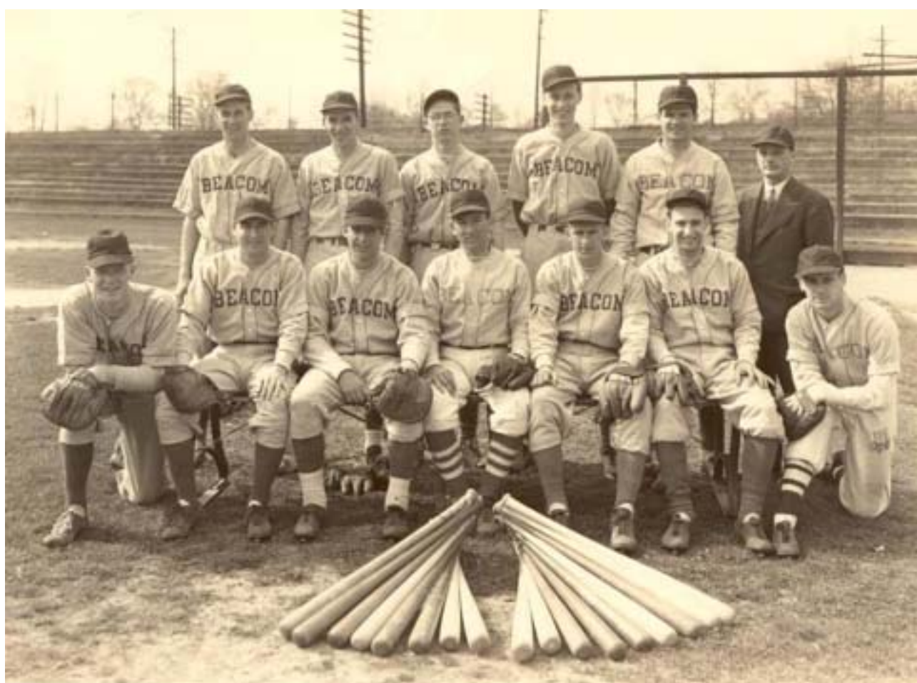
GBC men's baseball team gets ready to go up to the plate.