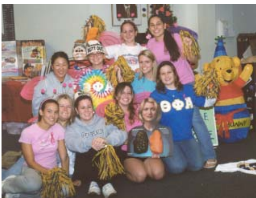
This group of GBC students got the word out on campus about the hazards of smoking by participating in the American Cancer Society's Great Smokeout campaign. Participants created displays and posters, distributed literature, and organized activities to educate fellow students.