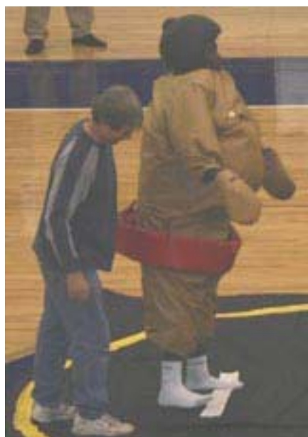
Inflated Sumo wrestlers found it difficult to maneuver in the ring.