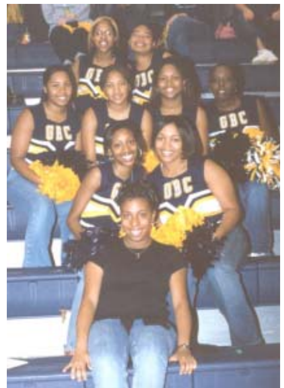
The cheerleading squad pumped up the crowd during Midnight Madness.