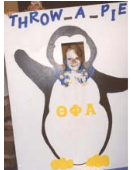
Theta Phi continues their pie-throwing Homecoming tradition at Midnight Madness.