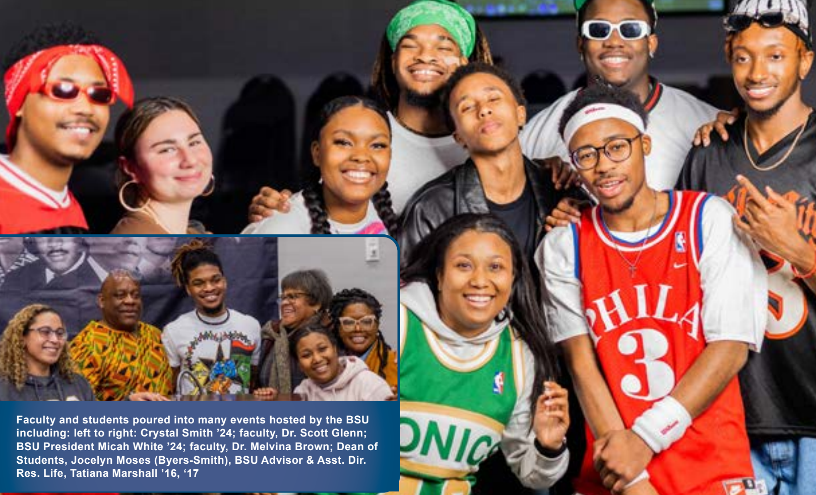
Black Student Union board members at the 2024 BSU Fashion Show