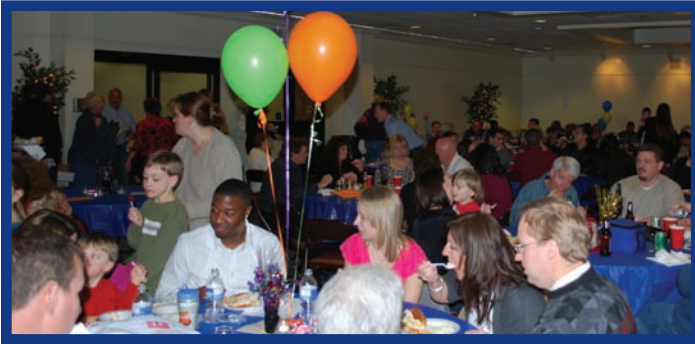
An overflow crowd "eats up" before "getting down" to some fierce bidding at the Alumni Board's Annual Beef & BYOB/Silent Auction.