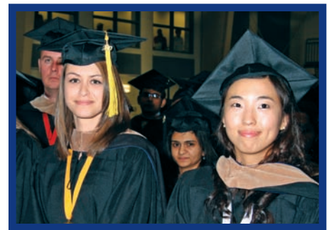
Goldey-Beacom students anticipating graduation.

community and you have learned the value of plain hard work: how you can't be let down if you put your heart and mind to something."