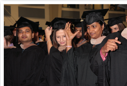
Goldey-Beacom graduates move tassels as their degrees are conferred.