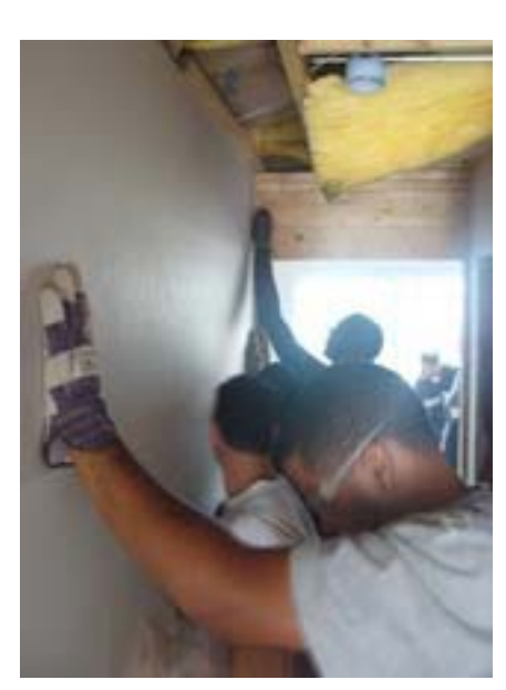
The team learns a new skill off the court hanging drywall.

For more information on Habitat for Humanity and volunteering visit www.habitat.org