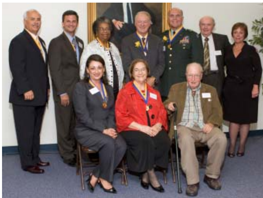
Past and present DAG recipients

This year's inductees demonstrate a strong commitment to work, community and family. They truly represent the best of GBC.