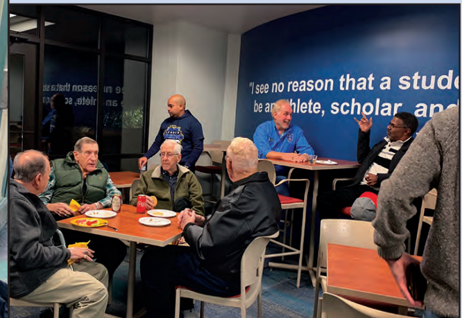
Residents from The Summit retirement community enjoy the Legacy Suite