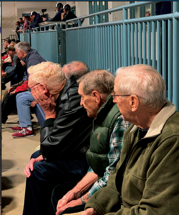
Members of The Summit retirement community watch the basketball game