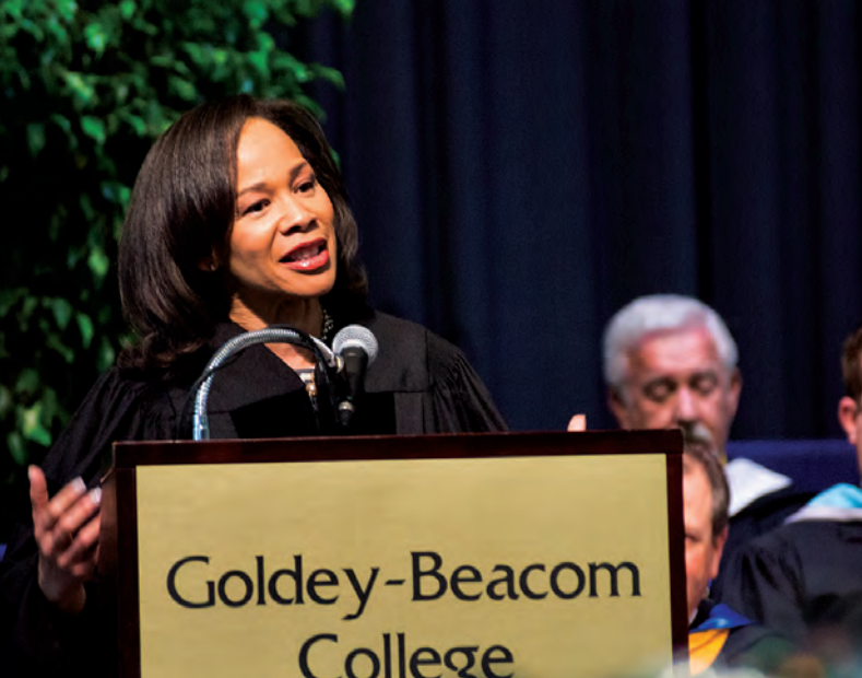
Keynote Speaker Lisa Blunt Rochester